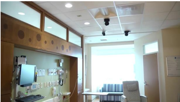
Patient Room with 3 HD DVI cameras

“The IHSE system installed by Blackrock Neuromed solved our system requirements perfectly” said Dan Collins, Clinical Engineer for CHW. “Our staff is able to view and control our monitoring system and cameras remotely. There are numerous options to control network load and display images on the many displays that we have in the control room.”