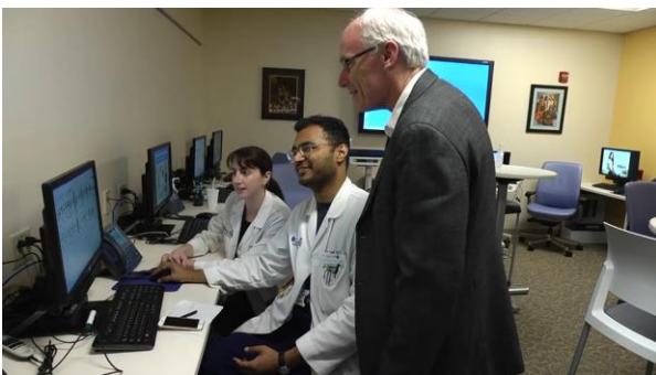
CHW Resident Physicians review patient data