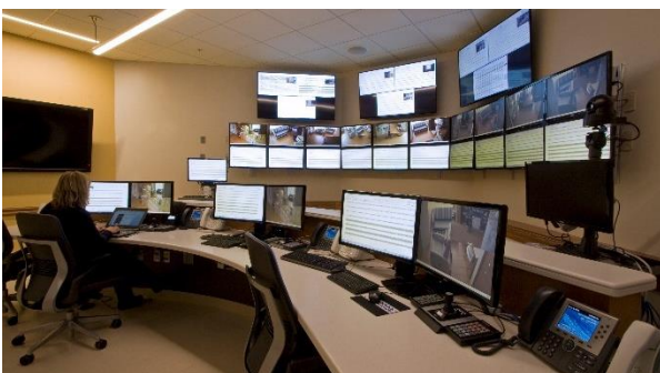
Control Room Wall Displays

“The solution reduced the amount of equipment that was needed in the control and patient rooms. The ability to pull up any recording in the control room or patient rooms allows the hospital staff to share the workload when they are at their busiest, thus allowing the level of care the patient deserves.”