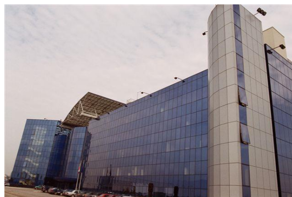
BULATSA main building

“The KVM system was extremely quick and easy to install, so we were up and running with only a minimal amount of delay. It has been totally reliable since installation which gives us great confidence in these products.”